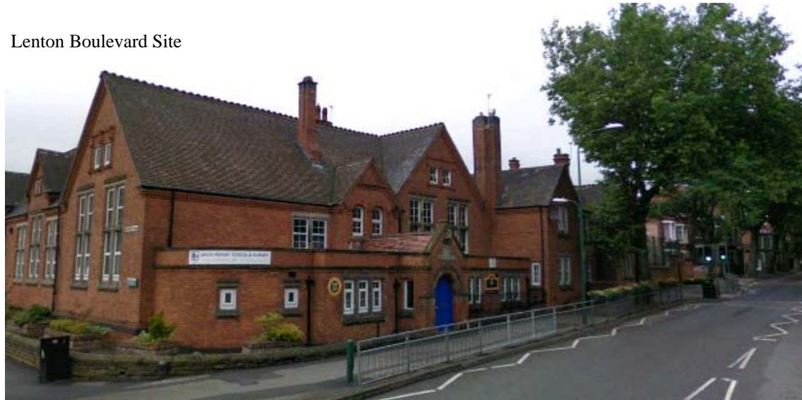
Lenton Boulevard Site

The expansion will be phased with the new site taking Reception and Year 1 pupils only for the first year and up to 30 Reception pupils in subsequent years.